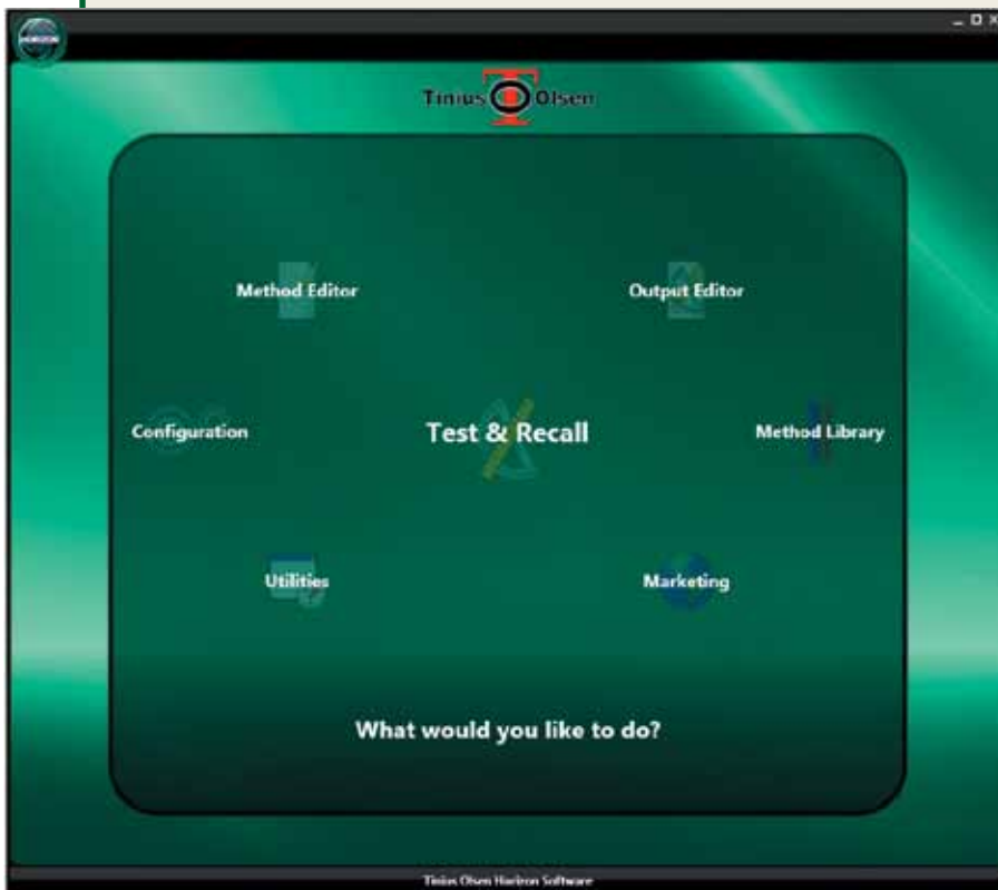
Fig. 1. Introduction screen and launch page for Horizon.

Tinius Olsen is proud to introduce you to the next evolution of testing software with our Horizon package. As part of our development process, we have taken the best features of our existing software offerings, including Test Navigator, QMat, and EP600 software, added a host of report writing and data manipulation capabilities and in the process, created a new, unparalleled testing platform that will make easy work of your materials testing programs, whether they're designed for the demanding rigors of R&D or the charting and analysis functions of QC testing.