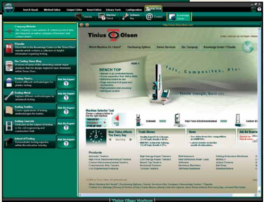
Fig 13. As an additional resource, you can also link directly to our application-based microsites which feature an Ask-The-Expert forum where users can ask questions of our market and application technologists.