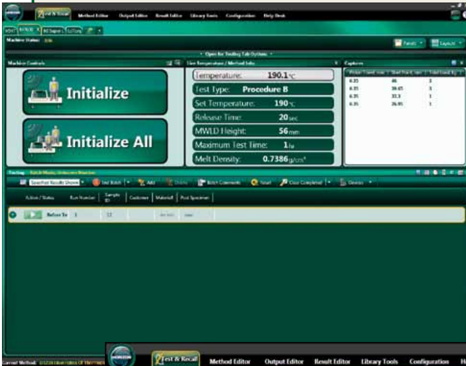
Fig. 6. How the machines within each tab are setup to communicate with Horizon software.