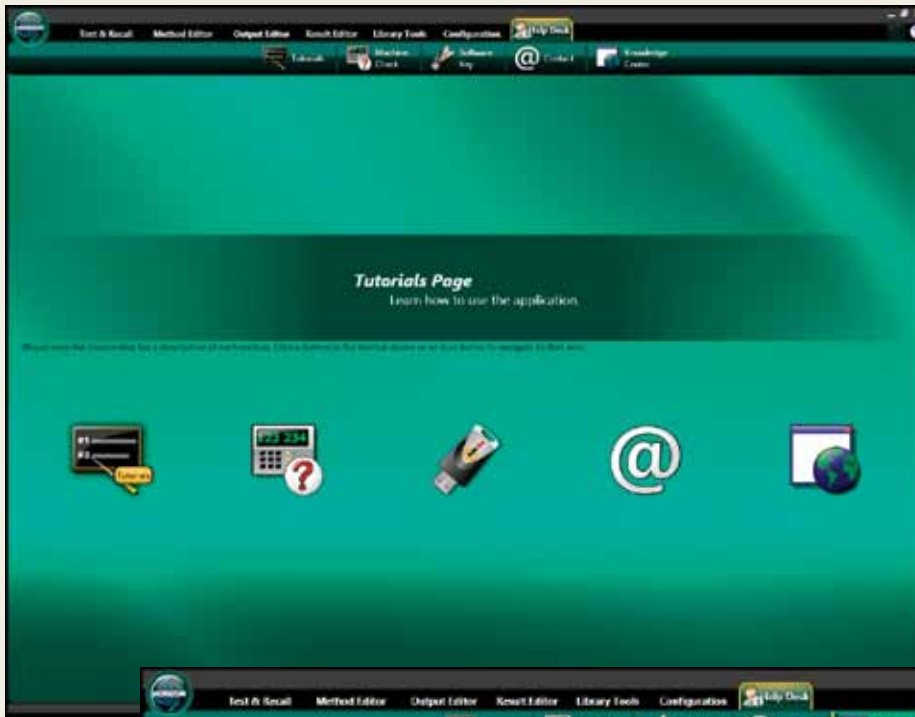
Fig. 12. Help Desk launch page. Here you can see the access to the on-disk / on-line tutorials, details of the program key, and emailable access to our manned Help Desk.

time you have questions on the operation of the software or how to make different reports, the program has built-in tutorials, on-line help, and Tinius Olsen Help Desk access.