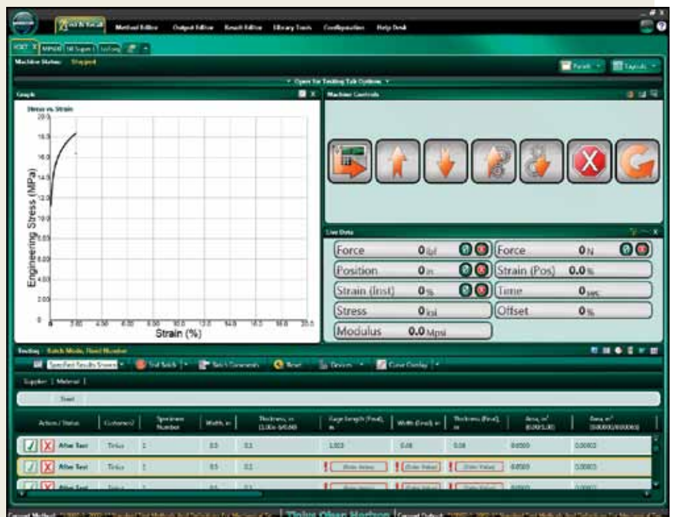
Fig. 2. Typical live test screen showing machine controls and resultant graph.