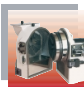
grinding chamber „pulverisette 13“