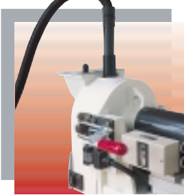
„p 13“ with dust extractor system